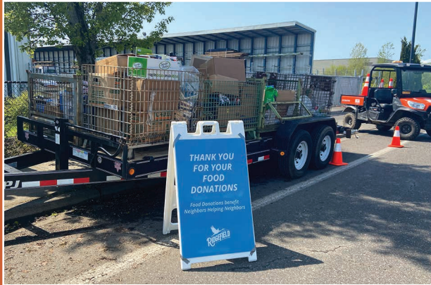
Donations for Neighbors Helping Neighbors collected at Spring Clean Up