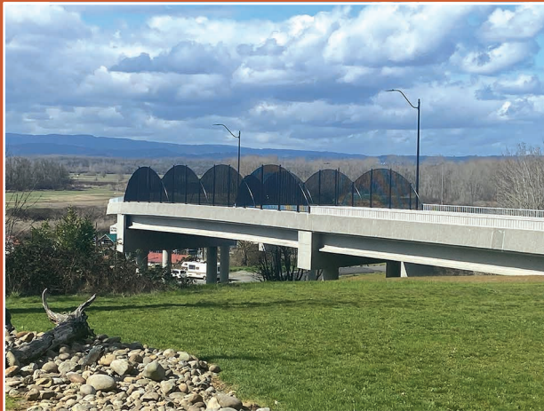
Our new bridge is complete!