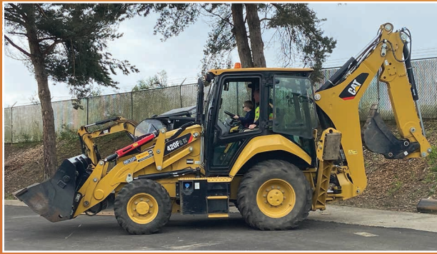
Take your child to work day